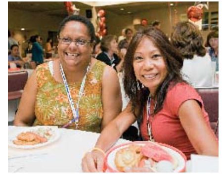
This August 2007 event netted $144,000 in new and renewed employee pledges.